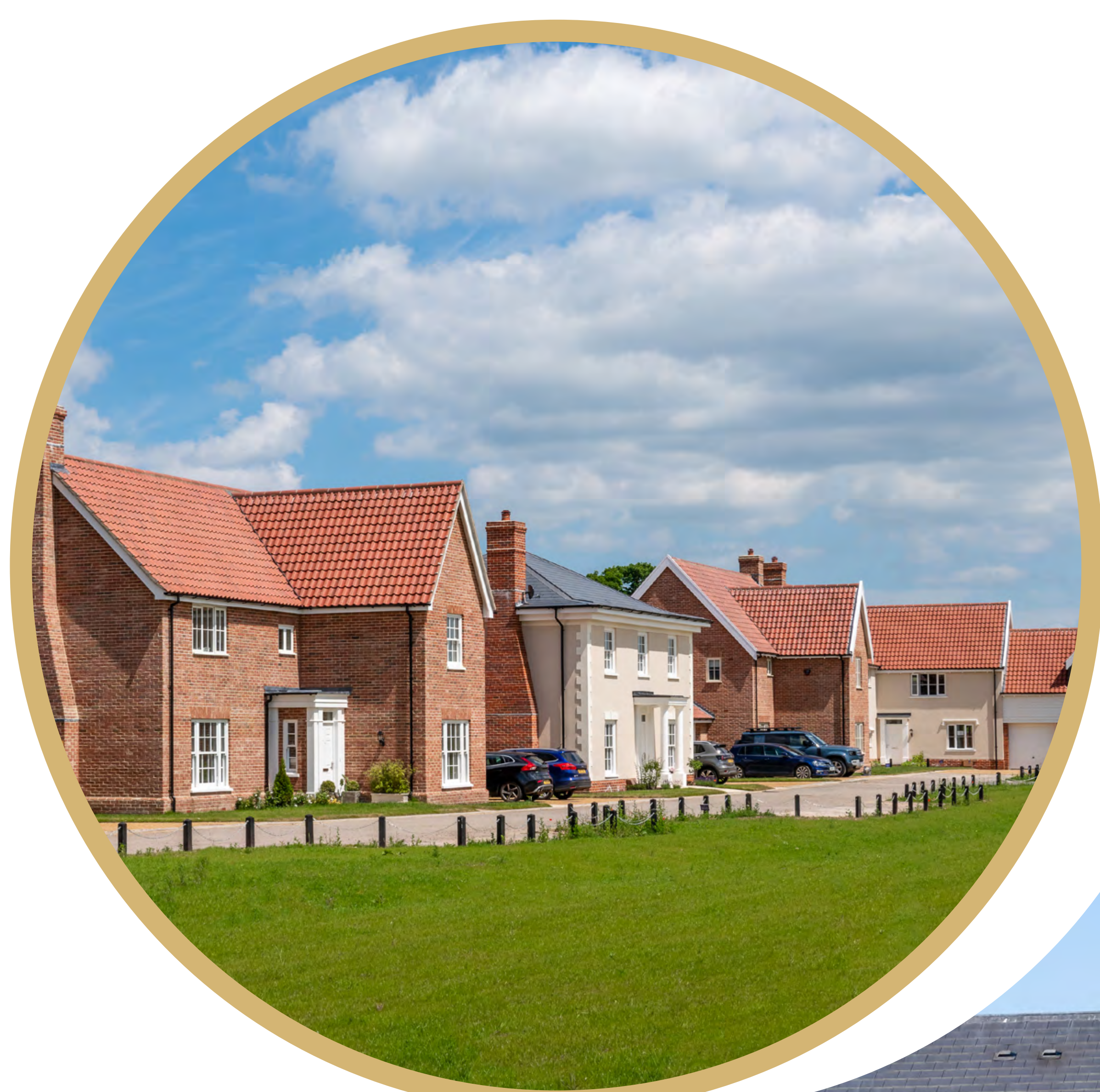
Examples of Hopkins Homes houses